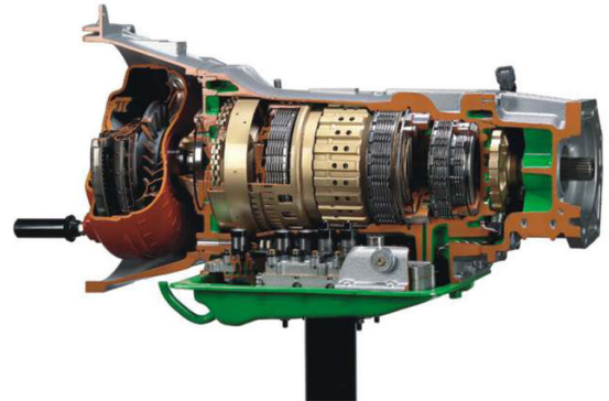
MEGART11042: Automatic Transmission 4x4 Vehicle