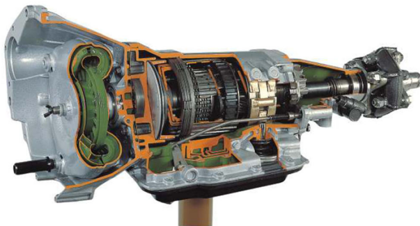
MEGART11040: Automatic Transmission

The Megatech Automatic Transaxle Trainer is designed to assist in educating the fundamentals of a front drive transaxle. The trainer features a fully functioning automatic transaxle that can be manually shifted through all forward and reverse gears. It features the popular A604 Automatic Transaxle found on most Chrysler front wheel drive cars. The package includes a complete competency based training program which instructs the student from basic operation and adjustment to complete overhaul of the transmission.